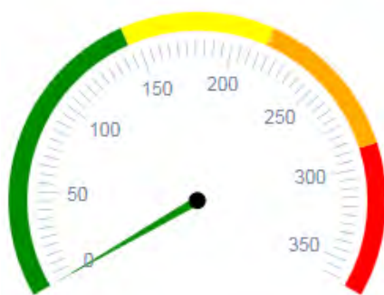
Systems In Alert (Live)